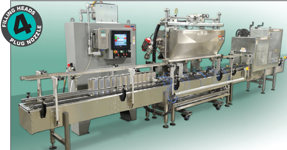
Four Head Automatic Net Weight Liquid Filling and Closing Machine with DFS® Direct Fill System, Stoltz Press and Crimp Press.