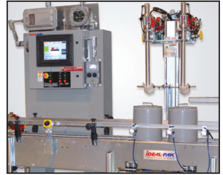
Ideal-Pak Model AE2-CNM with Manifold Cart & 2 fill lance nozzles configured for bottom filling.