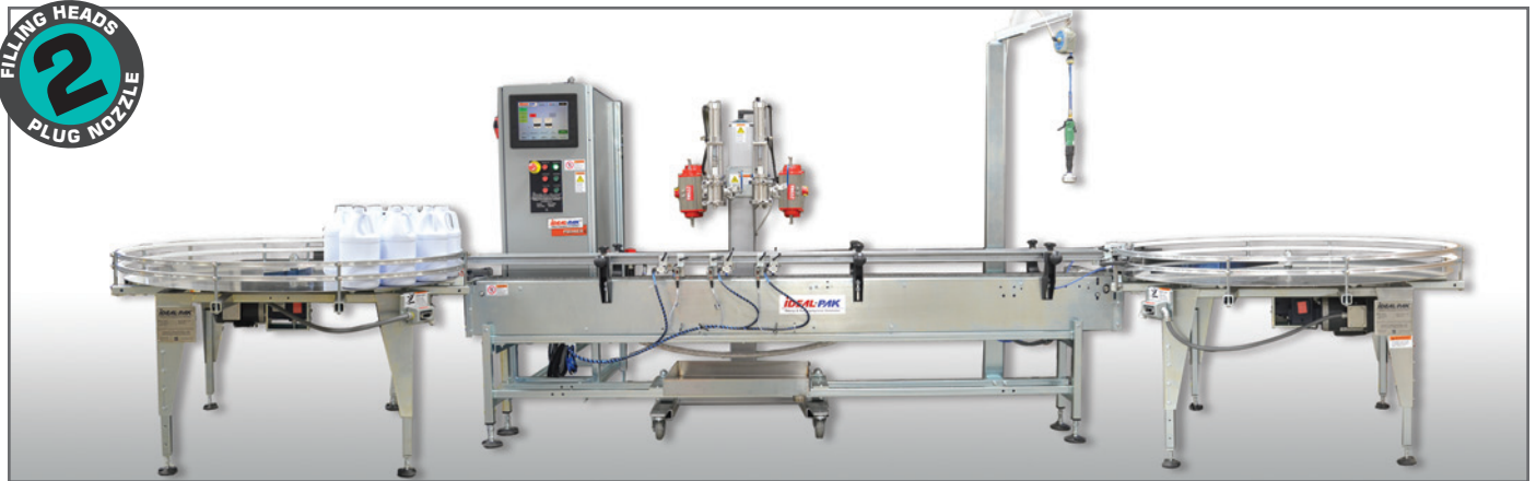
Ideal-Pak Model AE2-CNM Two Head Automatic Net Weight Liquid Filling Machine with (optional) In-Feed and Out-Feed Rotary Tables.