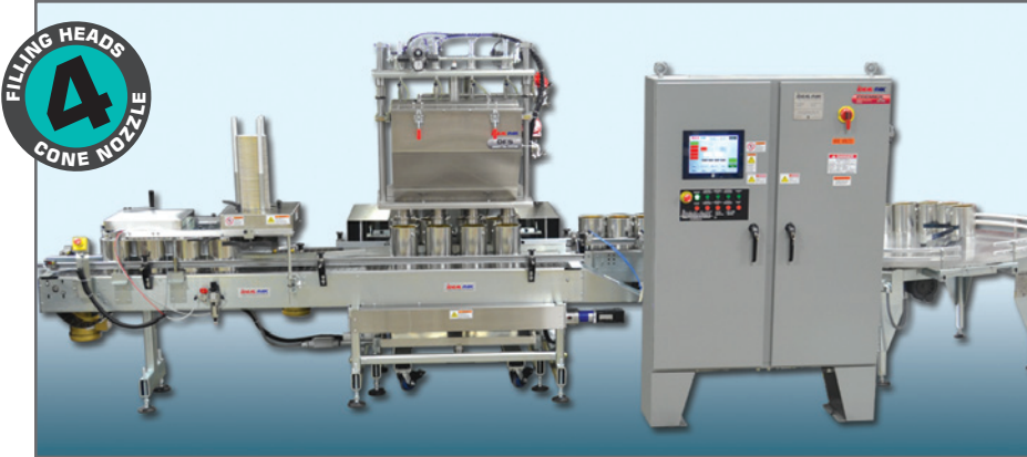
Ideal-Pak Model AE4-LAM Automatic Net Weight Liquid Filling Machine Shown (above) includes: DFS® Direct Fill System, Lid Placer (Model LPA-0000), and Heavy Duty Roller Closer Assembly (Model 2340-HR) with No-Lid Sensor, and Rotary In-feed Accumulation Table.